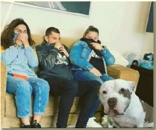
Day 12, Quarantine ....